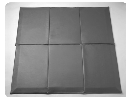
Connect two Floor Cushions to create a wider area of coverage

NOTE: Due to the random possibility of falls, the Posey Company makes no guarantee, express or implied, that the user is protected from hip trauma.