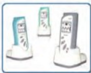
Battery charger stand

The latest 10 minutes trend graph and table of SpO 2 and Pulse Rate can be reviewed in the screen