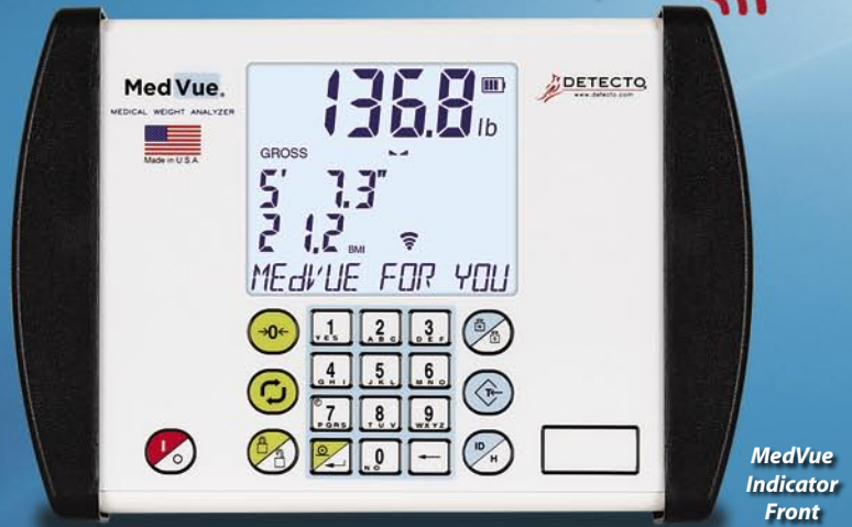
MedVue Indicator Front