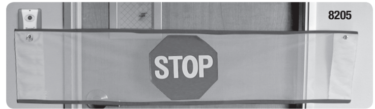
REF 8205 Door Guard Alarm

ALWAYS test after application to door. To test the Door Guard, place your hand or arm against the mesh to move the banner far enough to disengage the magnet from the faceplate of the alarm. Alarm should sound.