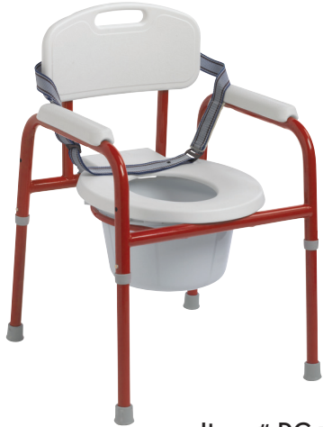
Item # PC 1000 RD Shown