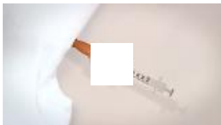
BD SafetyGlide™ Insulin Syringe 6mm...