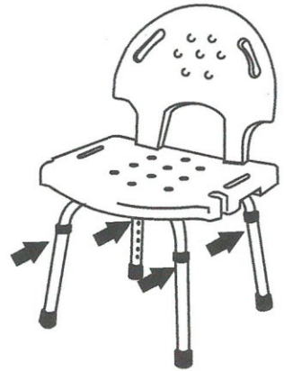
Figure 1: Adjustment areas on legs

! WARNING If adjustable, ensure that the spring buttons protrude fully through the adjustment holes of the leg frames.