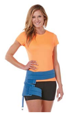
WrapOn Hip Pad (11.5" x 12") Long strap length = 44" Short strap length = 26"