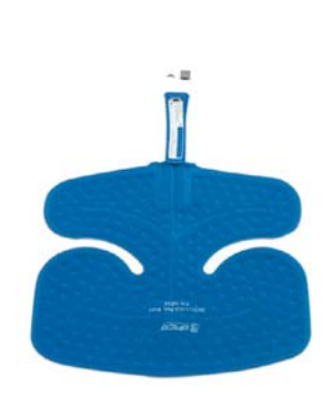
Intelli-Flo Multi-Use Pad (13.5" x 14.25")

These revolutionary pads offer temperature specific to each treatment area, allowing for consistent cold delivery. The ergonomic design provides exceptional coverage, static compression, and patient comfort. Intelli-Flo Pads are compatible with Polar Care Kodiak only. Proper use requires an insulation barrier between the Intelli-Flo Pads and the patient's skin. The water impermeable Sterile Polar Dressings offered by Breg provide an appropriate and complete barrier between the pad and the patient's skin.