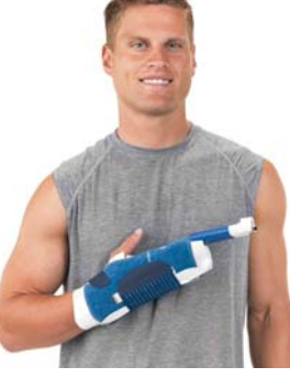
Intelli-Flo Hand / Wrist Pad (8.25" x 9.75")