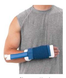
Shown on Hand Intelli-Flo 3x5 Pad (3" x 5")