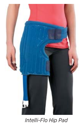
(13" x 20")