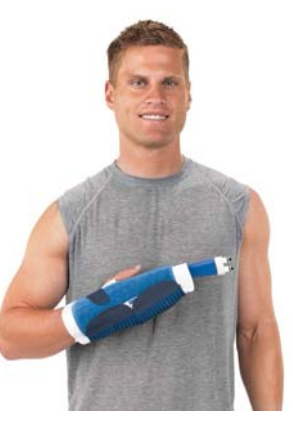
Hand / Wrist WrapOn Pad (8.5" x 9.75")