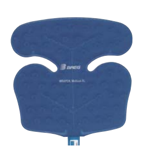
Multi-Use XL WrapOn Pad (11.25" x 11.25")

The WrapOn Polar Pads' ergonomic design provides exceptional coverage and patient comfort. Elastic straps offer static compression while holding the pad firmly in place. WrapOn Pads may be used with the Polar Care Glacier, Cube, and Cub only. Proper use requires an insulation barrier between the pad and the patient's skin. The water impermeable Sterile Polar Dressings offered by Breg provide a complete barrier between the pad and the patient's skin.