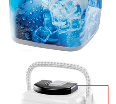
Polar Care Kodiak Battery Pack (optional)