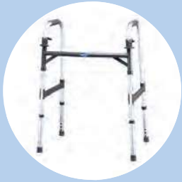
Invacare® Heavy-Duty Paddle Walker Model# 6291-HDA