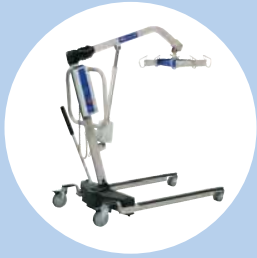
Invacare® Reliant™ 600 Heavy-Duty Lift Model# RPL600-1