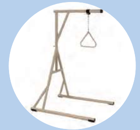
Invacare® Bariatric Floor Stand with Trapeze Model# BARTRAP