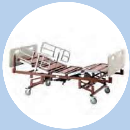
Invacare® BAR750 Bariatric Bed Model# BAR750

The Invacare® Trapeze unit is an important patient room accessory designed to help the users change positions while in bed and to aid in transferring from bed to chair with easy attendant assistance. Trapeze units have a wide range of height adjustments and handbar positions to maximize patient accessibility.