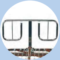
Invacare® Heavy-Duty Bed Rail Model# BAR6640IVC