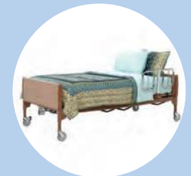
Invacare® BAR600IVC Bariatric Bed Model# BAR600IVC