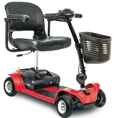
Go-Go ® Ultra X 4-wheel