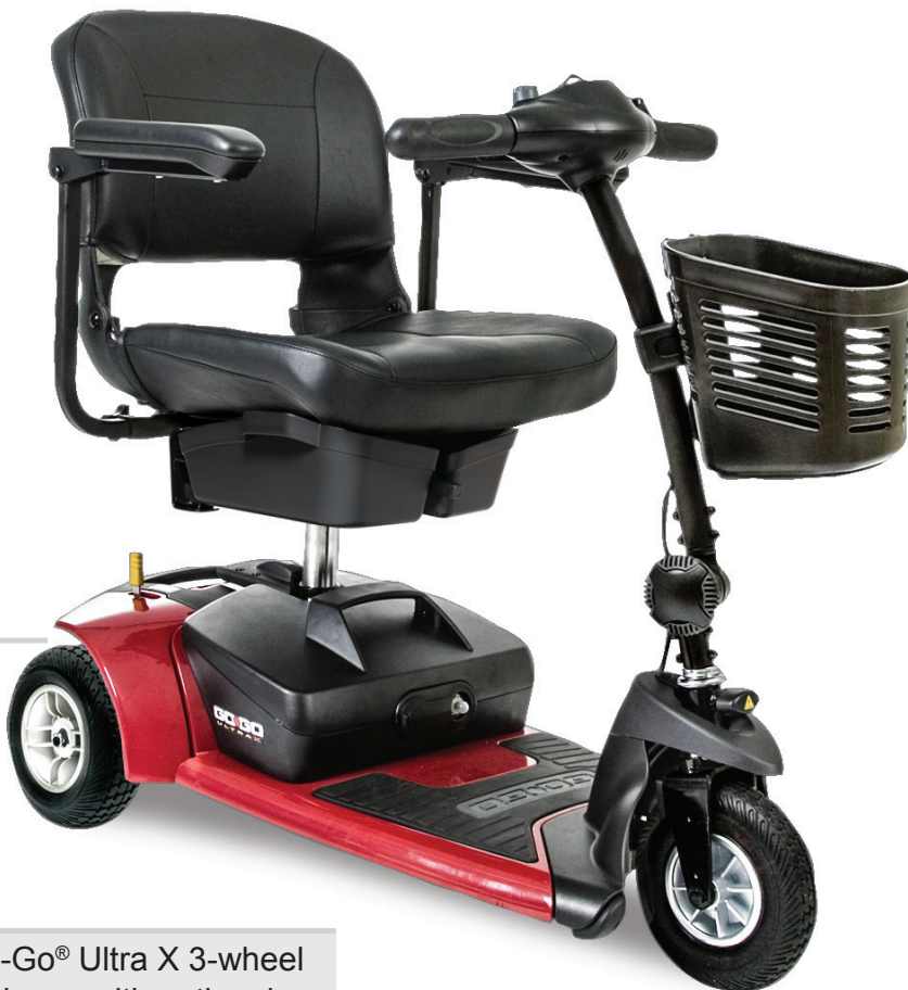
Go-Go ® Ultra X 3-wheel shown with optional under seat storage

The Go-Go ® Ultra X is loaded with features such as one-hand disassembly and a convenient drop-in battery box for worry-free travel. With a 260 lb. weight capacity, a maximum speed up to 4 mph, a per charge range up to 6.9 miles on the 3 wheel and 7.2 miles on the 4-wheel, Go-Go Ultra X is an exceptional value.