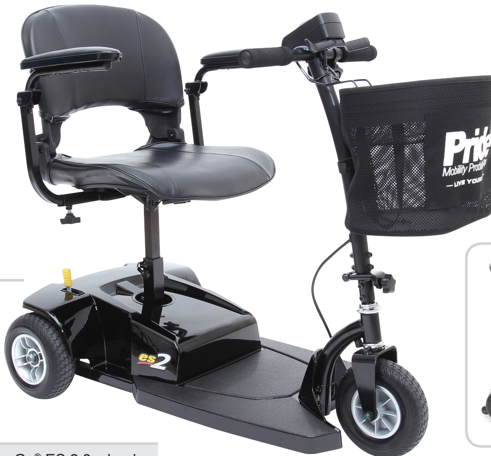
Go-Go ® ES 2 3-wheel

The Go-Go ® ES 2 from Pride ® combines exceptional value and easy transportation together in a compact, lightweight package. The stylish Go-Go ES 2 has a weight capacity of 250 lbs., variable motor speeds and a convenient canvas basket located on the tiller.