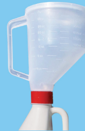
NEW FUNNEL RXFUN32