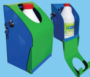
NEW SECURE RX DESTROYER™ LOCKBOX 64 OZ & 1 GALLON BOTTLE RX64LCKBX / RX1.0LCKBX