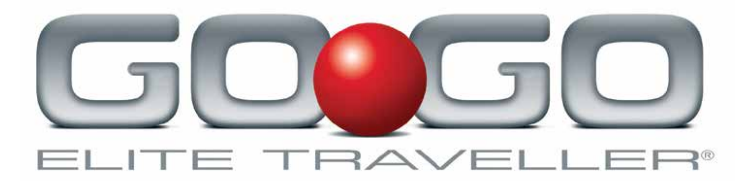
Go-Go Elite Traveller® 3-wheel