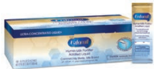
Enfamil® Human Milk Fortifier Acidified Liquid 100 vials/carton, 2 cartons/case #146301