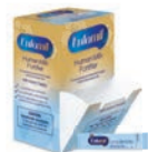
Enfamil® Human Milk Fortifier Powder 100 units/carton, 2 cartons/case #201418