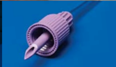
New threaded spike connector is compatible with Nestlé Ultrapak®* container and SpikeRight system for nutritional delivery.