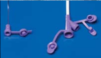
New connectors available on both Pediatric and Adult tubes