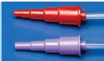
Redesigned stepped connector has a larger tip and fewer steps to reduce misconnections