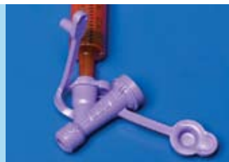
Y-port connects only with Medication or Oral Tip Syringes