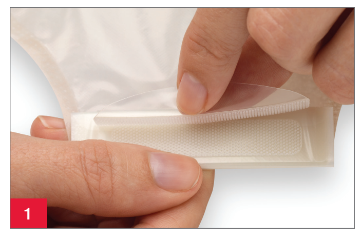
Opening Lift from the center of the transparent flap

Before you apply your new pouch, close the pouch tail (see Figure 4 and Figure 5)