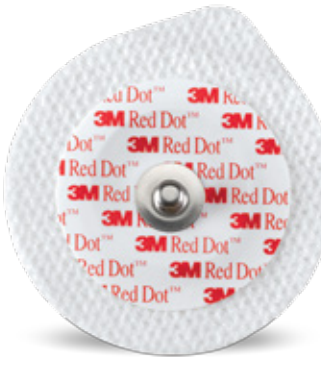
3M<sup>™</sup> Red Dot<sup>™</sup> Monitoring Electrode with Soft Cloth Tape Backing 2245-50

The tender skin of younger pediatric patients is a consideration when selecting the backing and adhesive characteristics of an electrode.