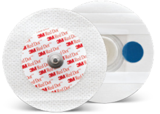
3M<sup>™</sup> Red Dot<sup>™</sup> Soft Cloth Monitoring Electrode 2255-50 front and back with blue abrader