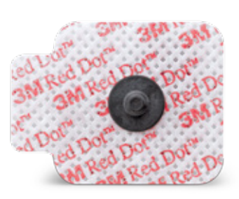
3M™ Red Dot™ Repositionable Monitoring Electrode 2660 -Radiolucent

1. 3M Technical Bulletin 70-2010-9070-4.