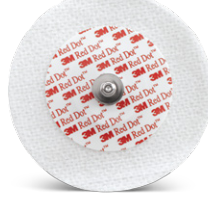
3M<sup>™</sup> Red Dot<sup>™</sup> Soft Cloth Monitoring Electrode 2238