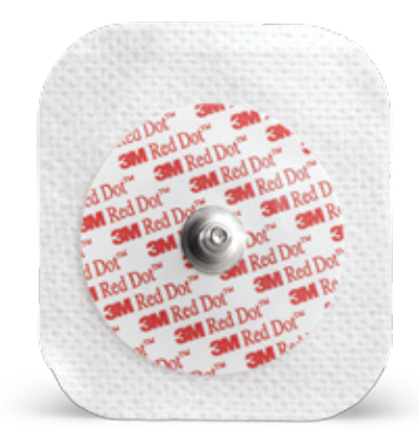
3M<sup>™</sup> Red Dot<sup>™</sup> Diaphoretic Soft Cloth Monitoring Electrode 2231