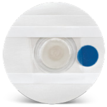
3M<sup>™</sup> Red Dot<sup>™</sup> Monitoring Electrode with blue abrader: 2249, 2255, 2256, 2259, 2270, 2271