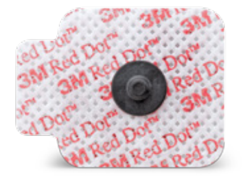
3M™ Red Dot™ Respositionable Monitoring Electrode 2670 -Radiolucent ★★★