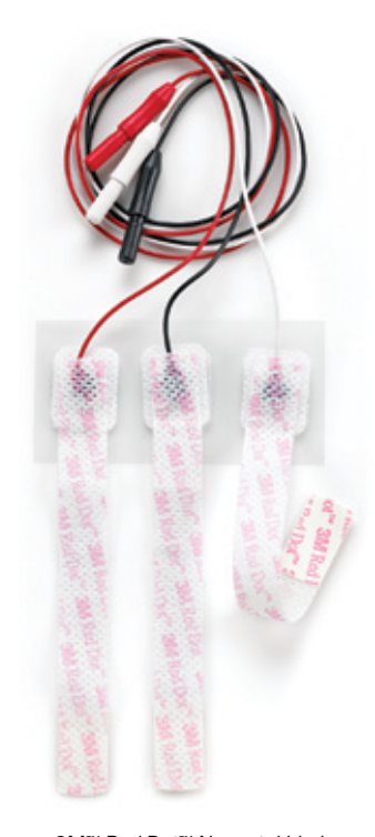
3M™ Red Dot™ Neonatal Limb Band Monitoring Electrode, Pre-Wired 2284