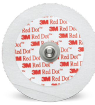
3M<sup>™</sup> Red Dot<sup>™</sup> Pediatric Monitoring Electrode with 3M<sup>™</sup> Micropore<sup>™</sup> Tape Backing 2248-50