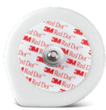
3M<sup>™</sup> Red Dot<sup>™</sup> Foam Monitoring Electrode 2237

Several 3M™ Red Dot™ Electrodes have a foam polyethylene backing that is fluid-resistant. Thus, they don't absorb liquids which could reduce the electrode's ability to adhere well. These electrodes are well suited for applications where fluids are present.