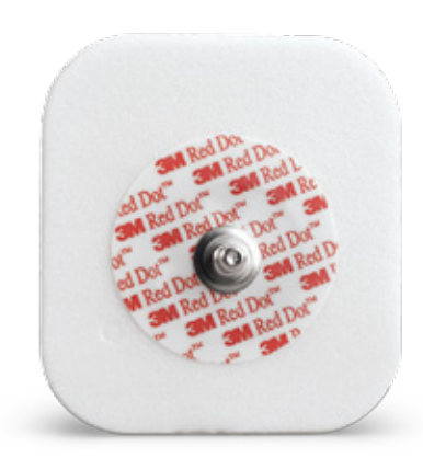
3M™ Red Dot™ Diaphoretic Foam Monitoring Electrode 2230

3M™ Red Dot™ Monitoring Electrodes 2270 and 2271 incorporate an abrader for gentle skin abrasion. Gentle skin abrasion results in lower skin impedance and improved EKG trace quality.