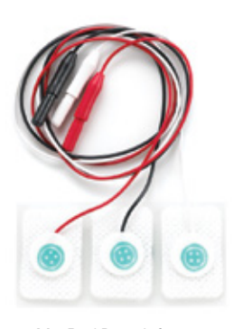
3M™ Red Dot™ Infant, Pre-Wired, Radiolucent Monitoring Electrode 2283