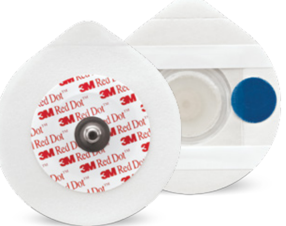
3M<sup>™</sup> Red Dot<sup>™</sup> Foam Monitoring Electrode 2259 front and back with blue abrader