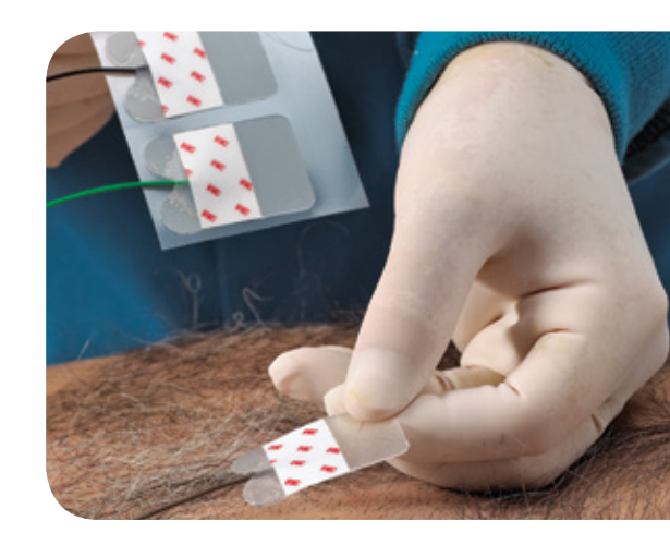
3M<sup>™</sup> Red Dot<sup>™</sup> Pre-Wired Monitoring Electrode 2289PA shown.