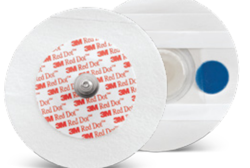
3M<sup>™</sup> Red Dot<sup>™</sup> Monitoring Electrode with 3M<sup>™</sup> Micropore<sup>™</sup> Tape Backing 2249-50 front and back with blue abrader