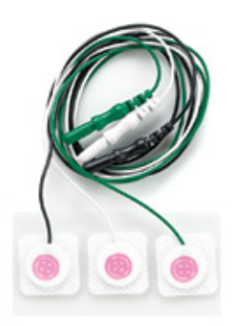
3M™ Red Dot™ Neonatal, Pre-Wired, Radiolucent Monitoring Electrode with Soft Cloth 2282L