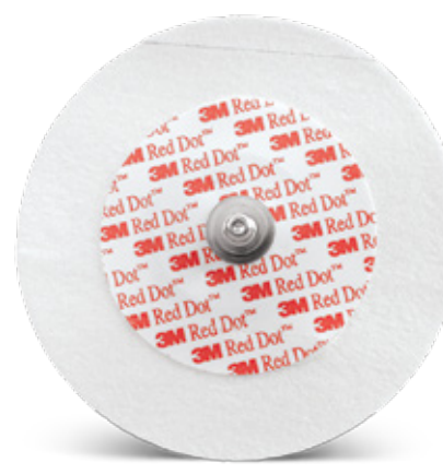
3M<sup>™</sup> Red Dot<sup>™</sup> Monitoring Electrode with 3M<sup>™</sup> Micropore<sup>™</sup> Tape Backing 2239

In today's patient population, fragile skin is often a concern whether due to age, medication or repeated removal of adhesive products. It's a delicate balance to protect the patient's skin and maintain good adhesion to obtain acceptable EKG trace quality.