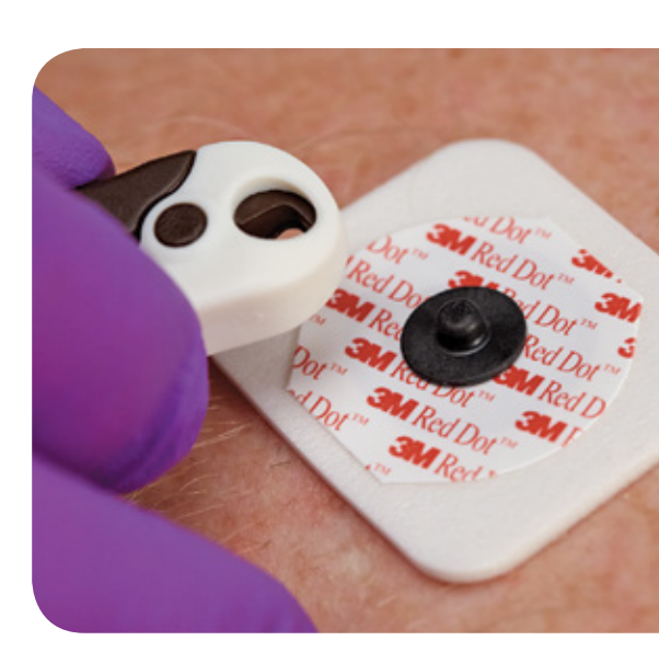
3M™ Red Dot™ Monitoring Electrode with Foam Tape and Sticky Gel 2570 and 5 Lead Reusable Leadwire, Philips to Pinch YMRLW5P51 shown.