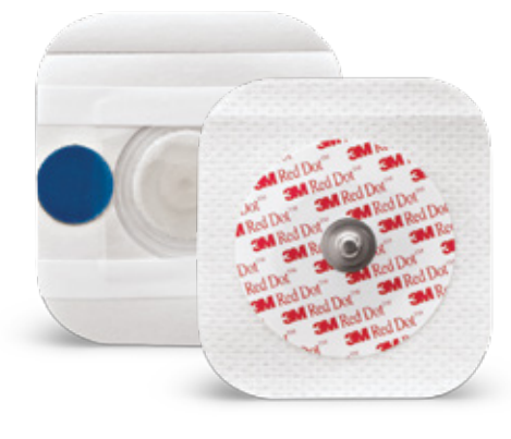
3M™ Red Dot™ Diaphoretic Soft Cloth Monitoring Electrode 2271 front and back with blue abrader