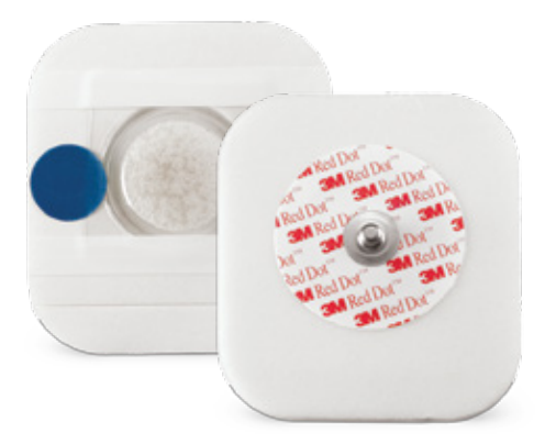
3M<sup>™</sup> Red Dot<sup>™</sup> Diaphoretic Foam Monitoring Electrode 2270 front and back with blue abrader