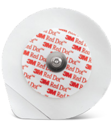
3M™ Red Dot™ Clear Plastic Monitoring Electrode 2235