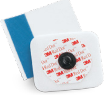
3M™ Red Dot™ Monitoring Electrode with Foam Tape and Sticky Gel 2570 - Radiolucent front and back with abrader