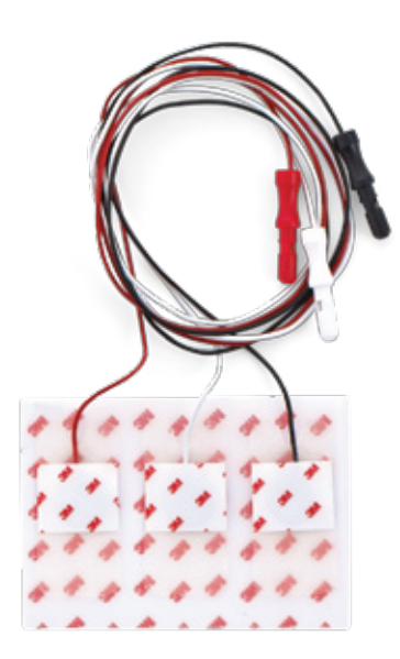
3M™ Red Dot™ Neonatal, Pre-Wired, Radiolucent Monitoring Electrode with Clear Tape 2269T