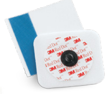
3M™ Red Dot™ Foam Monitoring Electrode 2570 - Radiolucent front and back with blue abrader