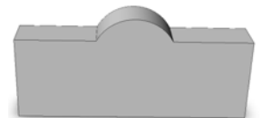
505847 - Inlet Filter