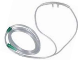
504833 - Cannula