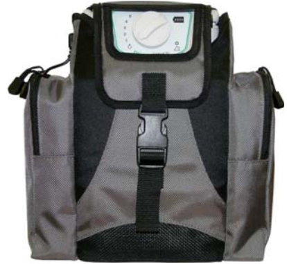
507303 - Back Pack Bag