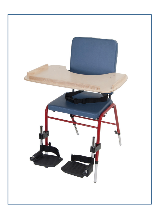
Item # FC 2024 Shown