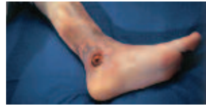
80% of venous leg ulcers are located inside the lower extremity.

The most common cause of venous leg ulcers is venous insufficiency due to failure of the one way valves in the lower leg. Incompetent valves reduce the efficiency of the muscle pumps tasked with returning venous blood to the heart resulting in venous reflux and venous hypertension. Venous hypertension increases the diameter of capillaries and alters their ability to regulate the balance of fluid, protein and cells passing into the interstitial space. Fluid balance shifts towards edema and a reduction in the delivery of nutrients and oxygen to the tissues leading to necrosis and the development of a venous leg ulcer.