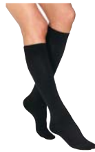
Women's Pattern Trouser