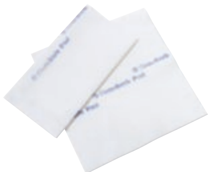
BS0013 ChemoSorb Pads