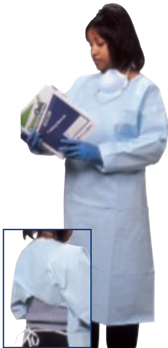
DP5000 Series ChemoPlus Poly-Coated Gowns