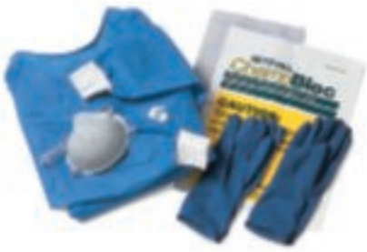
CT4100/CT4101 ChemoSafety Prep/Admin Kit