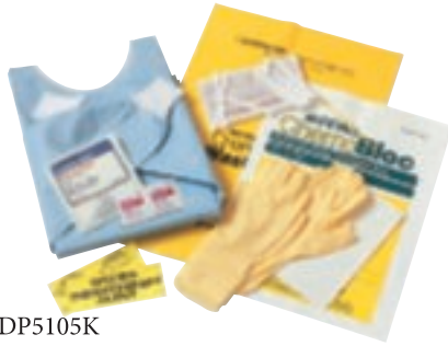
DP5105K ChemoBloc Prep/Admin Kit