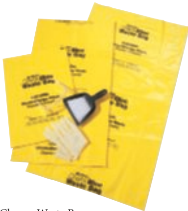
Chemo Waste Bags (Other products shown not included- sold separately)