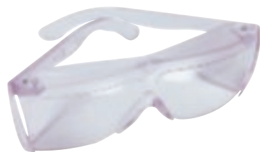
CT0400-1 Plastic Eyeglasses w/Side shields