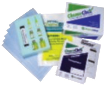
CT4200 Pharmacy Kit

The ChemoCheck Training and Certification program provides participants with self-administered, hands-on training for the techniques required to safely handle chemotherapy drugs. At the conclusion of this program, the participant will be able to understand and use proper procedures while handling cytotoxic drugs.