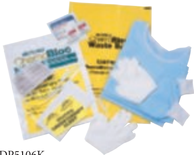
DP5106K ChemoBloc Prep/Admin Kit