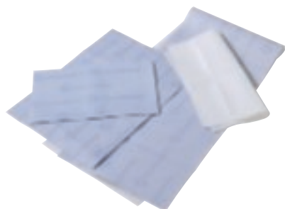
CT0300 Series Prep Mats