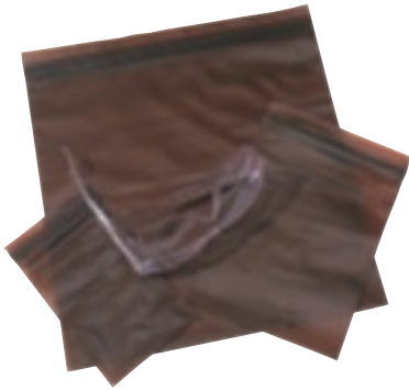
BS1100 Series UV Protection Transport Bags (Other products shown not included- sold separately)