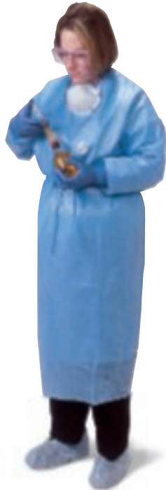
CT5500 Series ChemoPlus Poly-Coated Gowns