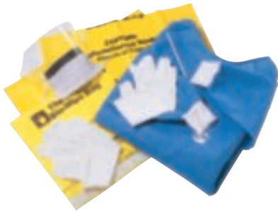
DP5108K ChemoBloc Home Health Spill Kit