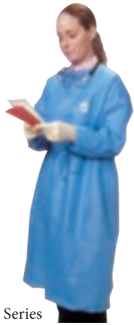
CT5500 Series ChemoPlus Gowns