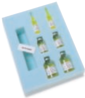
CT4220 ChemoCheck Training Refill Kit