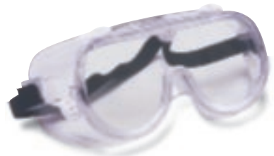
DP5030G Wraparound Goggles