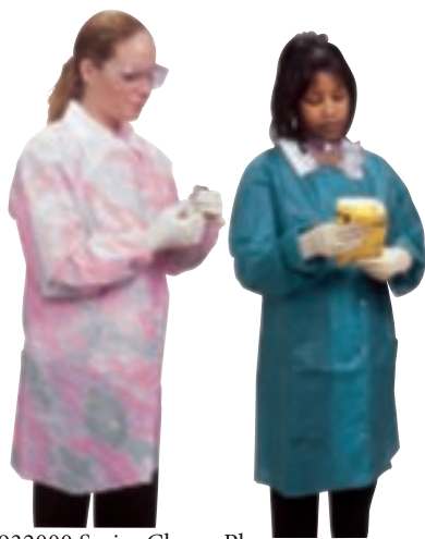
932000 Series ChemoPlus OncologyPlus Gowns