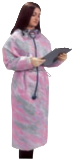
932000 Series ChemoPlus Multicolor Gowns