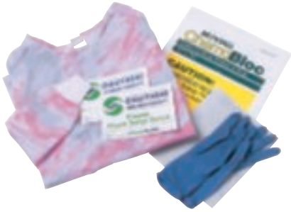
CT4020 ChemoSafety Prep/Admin Kit