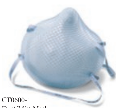
CT0600-1 Dust/Mist Mask