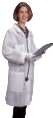
BB6500L SERIES OncologyPlus LabCoat