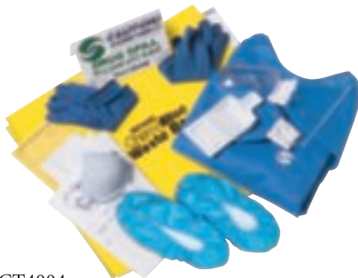
CT4004 ChemoSafety™ Spill Kit