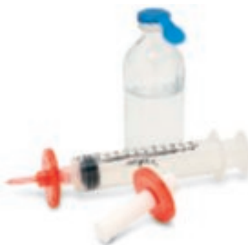
DP5201V Vial Venting Chemo Pin

A system designed to prevent aerosolization of chemotherapy and other hazardous drugs into the atmosphere during reconstitution.