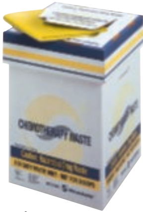
CT1500 Soft Waste Corrugated Container