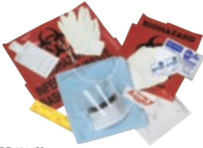
BB6016K BioBloc™ Spill Kit