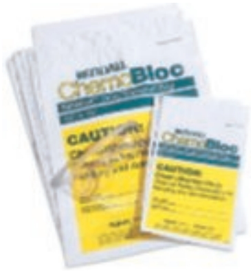
CT0500 Series Safelock Transfer Bags