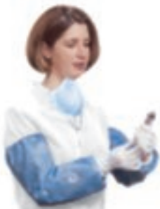
CT5500 ChemoPlus Sleeves