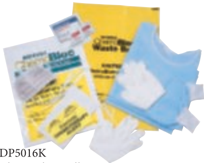
DP5016K ChemoBloc Spill Kit