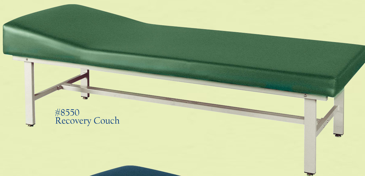
#8550 Recovery Couch

Winco's recovery couches are a great choice for almost any medical facility or school nurse's office. With a height of only 19" and a weight capacity of 400lbs. a patient can sit or lie comfortably.