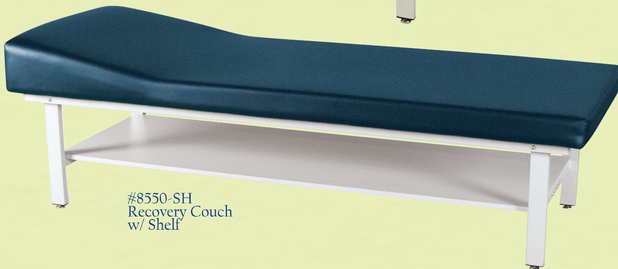
#8550-SH Recovery Couch w/ Shelf