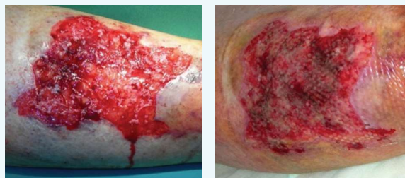
Figure 3: Small fragments of minced skin are demonstrated on the left and coalescing of the fragments is demonstrated on day 8 on the right.

ing and be protected from infection. Soaking the graft fragments with Vashe at each dressing change provides protection to them as they coalesce into a solid sheet of skin to complete closure of the wound (Fig.3)