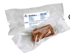
CoFlexNL is available sterile

U.S. Patent Nos. 5.762.623 & 6.156.424 European Patent No. 0839222