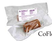
CoFlexLF 2 is available sterile

CoFlex products are versatile bandages that can be used in a variety of applications to meet the needs of healthcare professionals.