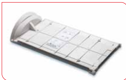
The high-quality folding mechanism guarantees a long service life.

The seca 417 stadiometer is ideal for mobile use. During regularly scheduled examinations, medical personnel check the nutritional condition and development of infants and toddlers. The process should go quickly, so it's important to be able to read results easily. The red markings and high-quality printing of the scale don't fade even after years of intense use.