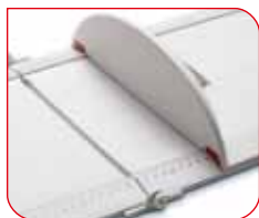
The measurement results are easy to read from the large scale.

A hinge joins together the two parts of the seca 417 measuring board. It has an integrated head piece and a separate foot positioner that smoothly runs along the gently raised guide rail. For a precise measurement, all the user has to do is place the head of the child against the head piece, stretch out the legs and move the foot positioner to the soles of the feet.