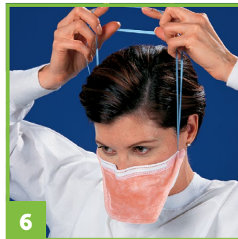
6 Pull the headbands up over your head.