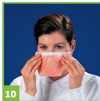
10 Continue to adjust the respirator and secure the edges until you feel you have achieved a good facial fit. Now, perform a user seal check.