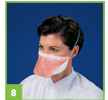
8 Position the remaining headband on the crown of your head.