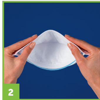
2 Slightly bend the nose wire to form a gentle curve.