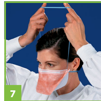
7 Release the lower headband from your thumbs and position it at the base of your neck.