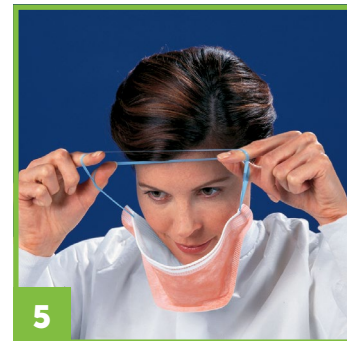
5 While holding the headbands with your index fingers and thumbs, cup the respirator under your chin.