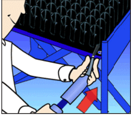
STEP 2 Slide the pump's rubber nozzle over the valve and inflate the cushion until it begins to slightly arch upward.