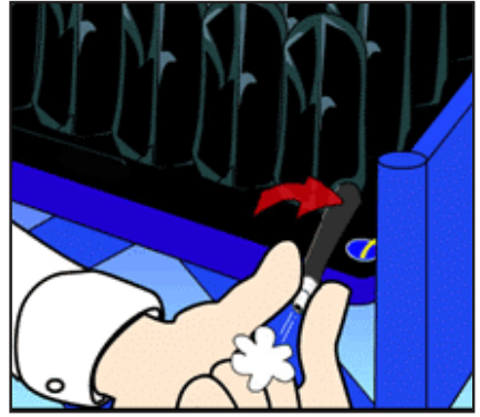
STEP 3 Pinch the pump's nozzle and turn valve clockwise to close. Remove pump. (Repeat steps 1 - 3 for remaining air valves on multi-valve cushions.)