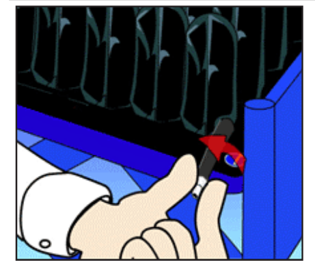
STEP 1 Place cushion on chair, making sure it is centered with air cells up, with air valve in front, left corner (when the user is seated). Consult your prescriber about alternative positions of air valves. Turn valve counterclockwise to open.