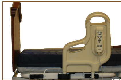
Industry's best assist handle for resident egress/ingress promoting safety and comfort. Shown in two locking positions.