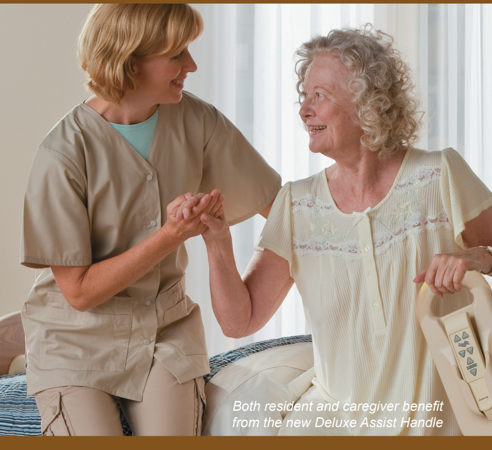
Both resident and caregiver benefit from the new Deluxe Assist Handle