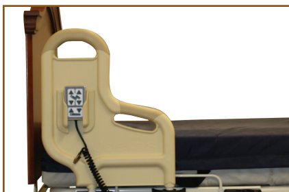
Deluxe assist handle shown with both pendant holder styles.