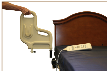
Easily removed for storage.