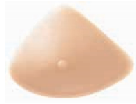
Essential Deluxe Light 2A, 254

This shape compensates for missing tissue under the arm.