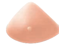
Essential 2A, 353 Essential Light 2A, 356

This shape compensates for missing tissue under the arm.